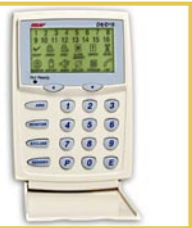
KEYPAD OPERATION Standard

A new range of X Series slide-in accessory boards includes a four Relay Board, a Reader Interface and the new X Series Output Expander for both the D8x and D16x panels.