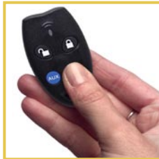
RADIO KEY OPERATION Optional