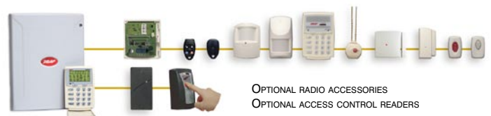
OPTIONAL RADIO ACCESSORIES