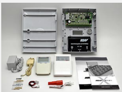
D8x Panel with LED keypad Part No. 106-000