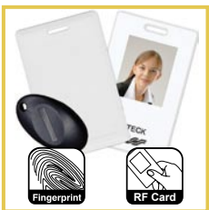
PROXIMITY CARD OPERATION FINGERPRINT OPERATION Optional