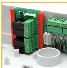
NEW ACCESSORY BOARDS Optional